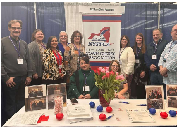
NYSTCA board members and district directors