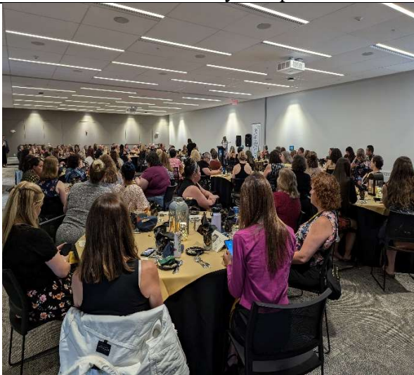
Over 150 alumni attended the banquet at Plymouth State University, NH