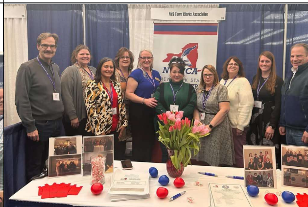
NYSTCA board members and district directors